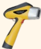
Portable Gold & Silver Testing Machine

Gold Souk, Deira, Gate No.3, Behind Dhakan Jewellers, Dubai, UAE.