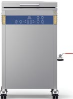
Elmasonic Xtra ST