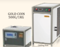
Metro Gold Melting Induction Furnace

Quality Products with Responsible After Sales Service