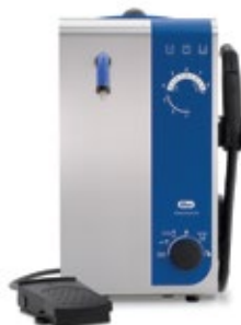
Elmasteam 8 Basic