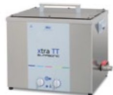
Elmasonic Xtra TT